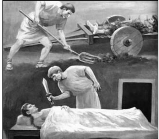
Murder at the happiest place on Earth? Can't be!