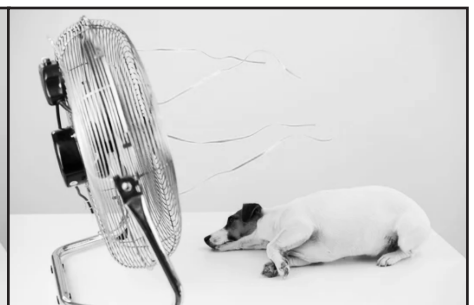
The Dog Days of Georgia