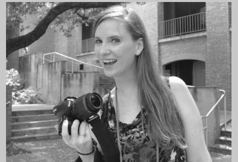
What JCLers think she does