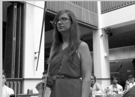
What her mom thinks she does