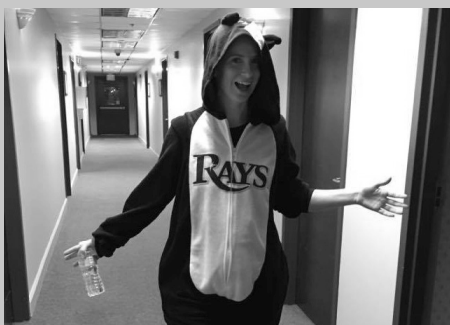
What SCLers think she does