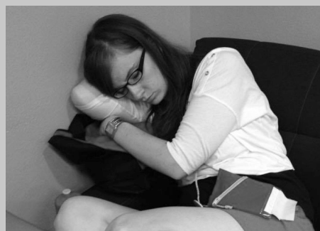
What she thinks she does