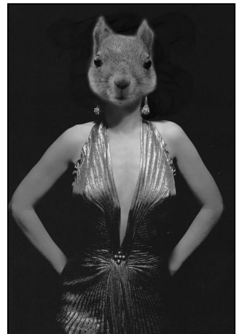
"Happy Brown Squirrel, Mr. President..."