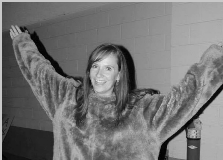
What her friends think she does